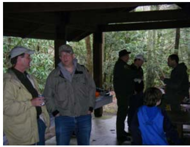
Everyone enjoying good food and conversation