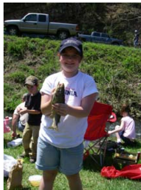
One happy fisherperson