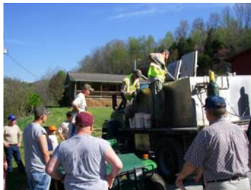
The stocking truck arrives with lots of Trout

Any kid that did not get to catch a fish did not go home empty handed. All kids that registered received a prize via Scott County Outdoorsman, Appalachian Whitetail Association and the state park.