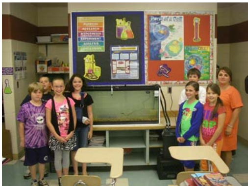
St. Paul Elementary Students and their eggs in the "eyed stage"

We have also been successful in obtaining donations from a couple of private donors, Alpha Natural Resources, Cumberland Resources, Clintwood High School and Colby Supply.