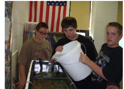
Castlewood Elementary students changing water in their aquarium..