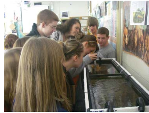
Coeburn High Students removing dead eggs from their aquarium.

Also the "good ole boys" of Home Hardware in Norton contributed supplies and material for each school to maintain their aquariums.